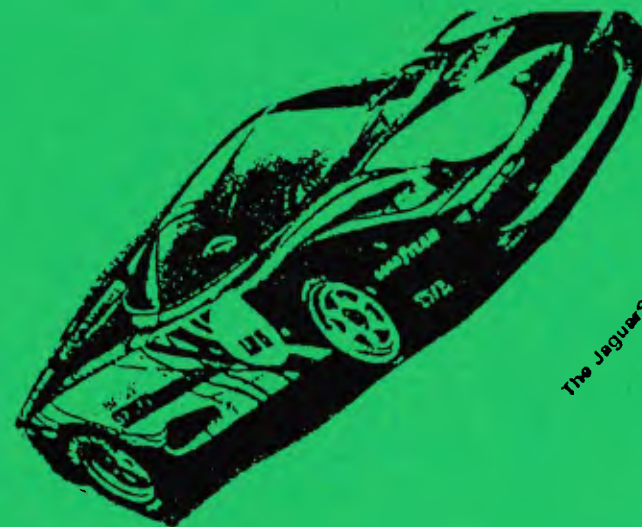
The Jaguar Sport XJR - 15