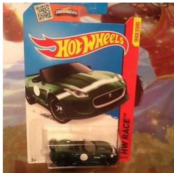
Hot Wheels 2015 F-Type Project 7

Well, back to the chores. I think I'm on my fifth 50 lb. bag of Purina since my arrival. My dog's father, Rex, doesn't get along with his son so I must avoid getting them together.