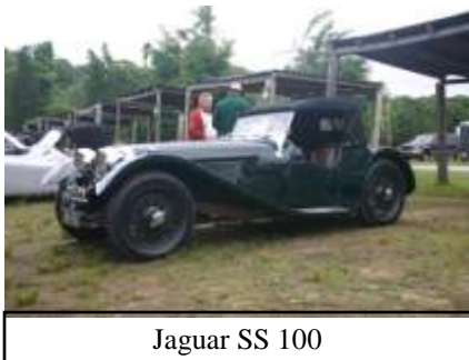
Jaguar SS 100

he purchased an SS100 for $40 (25 pounds) and introduced me to the Marque. He later had