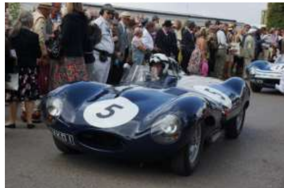
Nick Mason's Jaguar D-Type

But even you die-hard Pink Floyd fans may not know that David Gilmour (lead guitar, vocals) and Nick Mason (drummer) are gear-heads. Nick has a car collection to die for that includes a Jaguar D-Type as well as a McLaren F1, Porsche 962, Ferrari 250 GTO, Ferrari 512S, a Lola T297, and many more.