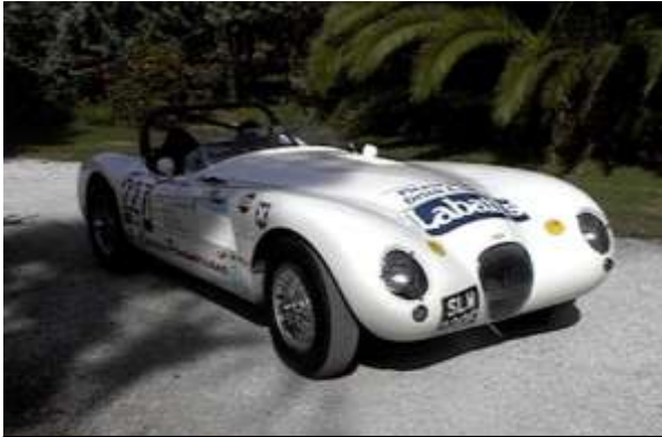
Nick Mason's Jaguar C-Type