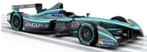
Jaguar Formula E

motorsport competition. In the autumn of 2016, Jaguar will enter the third season of the FIA Formula E Championship as a manufacturer with its own factory team. Formula E is the world's first global single-seater championship for electric powered cars. It will seem strange to see these cars torque off the line or accelerate down a straight – in near silence. No ear-plugs needed to shield ones-self from the deafening high RPM engines, as we did for Formula 1 and Indy Cars. I guess I will get used to it.