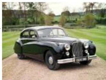
Jaguar MK VII

Manufacturers and Traders 48,000 rolled off the production at JLR's factories in Solihull, Castle Bromwich, and Halewood in 2015. However,